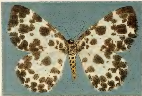
Fig. 5. Inouea cyclobalia (West), ♀, Mindanao.

Abdomen. Cavi tympani large, sub-globular, without lacinia. Sternite A3 with patch of about 15 weak setae. Apodemes between tergites A1 and A2 narrow, in ♀ curved, claw-shaped.